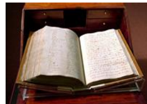
Image: James Cook (1728-1779) Endeavour journal 1768-1771 Manuscripts Collection, NLA.