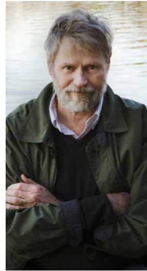
Image: Composer Ross Edwards

We also plan to record and distribute the work, along with a number of other special tribute performances, as the Trust's contribution to the commemoration of this historic milestone. Further details will be announced in November 2014.