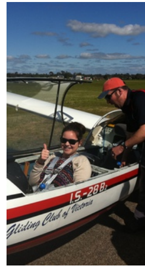
Image: Taking flight - participating in the Connect9 component of the Benalla Education project

The latest evaluation report by The University of Melbourne notes, "It is readily apparent that 2012 has been a markedly successful year. There are multiple stories and compelling instances of success in re-engaging young people to education and educational aspiration, of helping young parents negotiate the dilemmas of parenting, of nurturing communal networks, of facilitating improvements in well-being at multiple levels, and of actively tapping into the extensive voluntary resources of a service-oriented regional community." Congratulations to Tomorrow:Today Foundation.